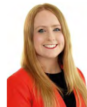
Mairéad Farrell TD Sinn Féin