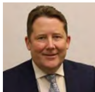
Minister Darragh O'Brien

Venue: St Michael's Theatre | Live Event