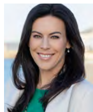
Jennifer Carroll MacNeill TD Fine Gael