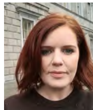
Neasa Hourigan TD Green Party