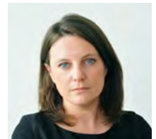
Suzanne Lynch Irish Times